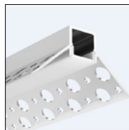
With opal cover